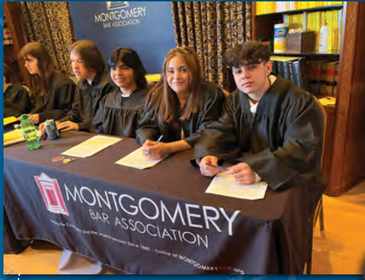
NPSD Educational Foundation sponsors a visit to Montgomery County Bar Association.