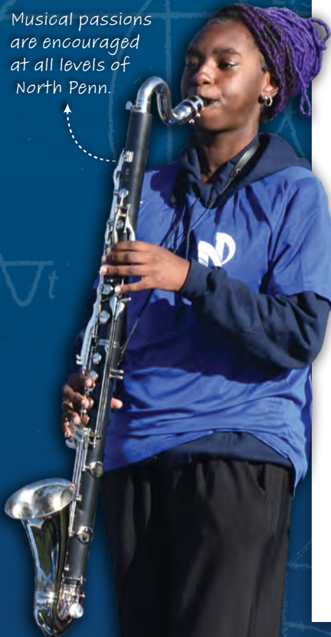
Musical passions are encouraged at all levels of North Penn.