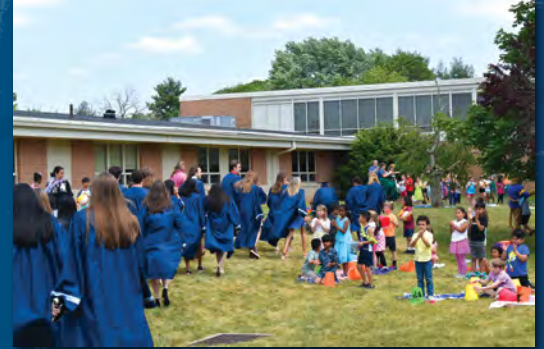
Senior walks provide a glimpse of the future for younger students.