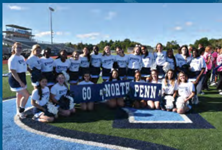
NPHS Cheerleaders show school spirit.

NPSD buses provide an environmentally friendly way to safely transport students.