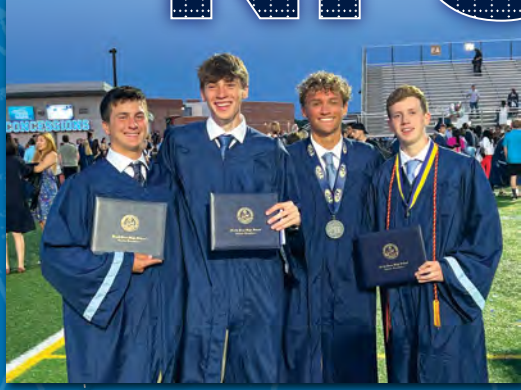
Graduates look forward to the future.