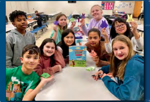
Extended School Care activities provide unique learning experiences.