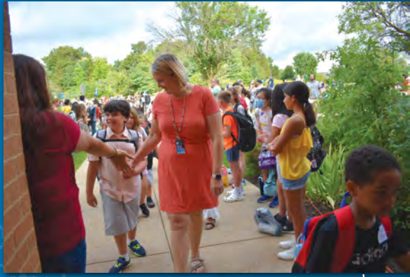
New adventures begin on the first day of school.