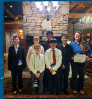
Middle School TSA members participate in networking, STEM-based competitions, and leadership opportunities.