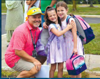
Teachers building relationships with students makes the first day of school an easier transition.