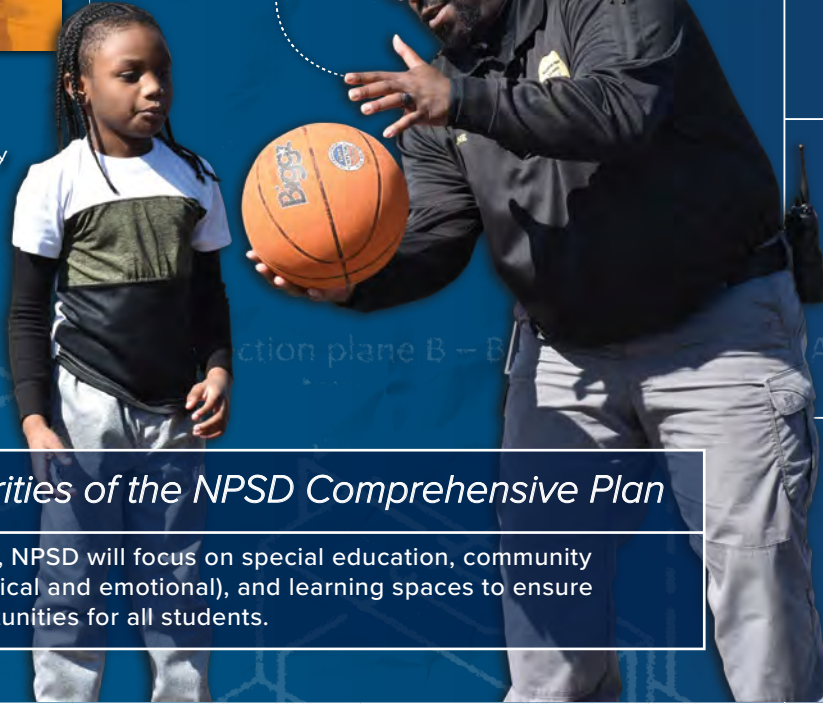
Security personnel build relationships with students.