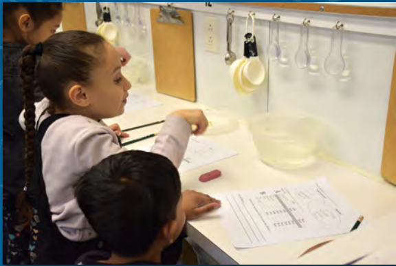
Students learn hands-on with the mobile agriculture lab.